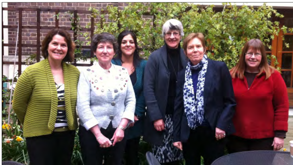
BAPT Board May 2013– May 2014