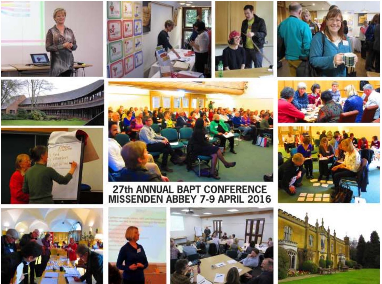
27th ANNUAL BAPT CONFERENCE MISSENDEN ABBEY 7-9 APRIL 2016